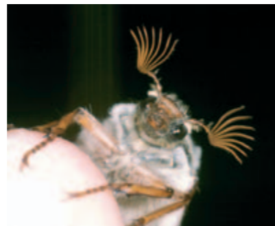
A cockchafer attentively spreads its feelers (antennae) to detect scents (signals) from members of its own species or plants.

Which of the many compounds detected in the gas chromatogram are of biological significance, however, and which belong to the matrix? Here the combination of gas chromatography and electrophysiology [GC/EAG for short] helps. The stream of compounds eluting from the column installed in the gas chromatograph is split; one part is channelled to a conventional detector which usually uses physico-chemical properties of the substances leaving the separation system, the other is analysed using a biological system. If semiochemicals of insects are being investigated, an insect antenna is removed from the insect's head and prepared so that it is fixed between two electrodes. This preparation can then be used 20 to 200 minutes. Whilst the conventional detector indicates every substance leaving the gas chromatographic separation system, with the antenna only those compounds that actually have receptors give rise to a signal, whereby the potential jump triggered through the nerv-