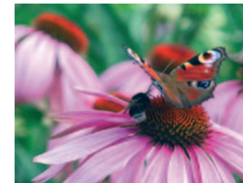
Peaceful (?) coexistence of a peacock butterfly and a bumble bee on a flower – in reality they are competing for food.

a completely different, microscopically small level. Here the female ovum seems to guide the male sperm with a seductive violet odour to then block entry to stragglers with a deterrent substance. This discovery could be used in developing natural contraceptives which confuse the sperm in the hunt for their target.